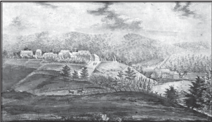
A View of Bethlehem from the North Side by Nicolaus Garrison, Jr. (1780)

For more information on the hotel, meals, maps, and tour of elite and working class neighborhoods of South Bethlehem, see additional packet materials.