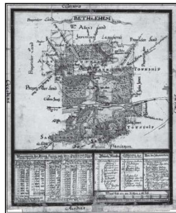
Bethlehem Map 1758

Sponsored by the Committee on Women and Minorities